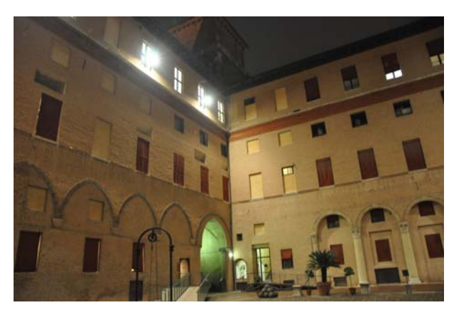
Figure 10: Interior Courtyard of Castello Estense: Social Event.