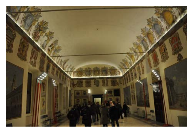
Figure 12: Private Guided Tour of the Castello Estense Museum. Social Event.