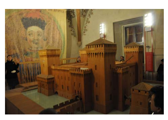
Figure 11: Small Scale Model of Castello Estense: Private Guided Tour of the Castello Estense Museum. Social Event.