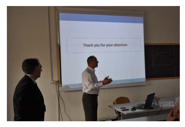
Figure 4: Prof. Marcel Staroswiecki.